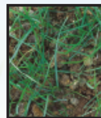
Appearance of new turf